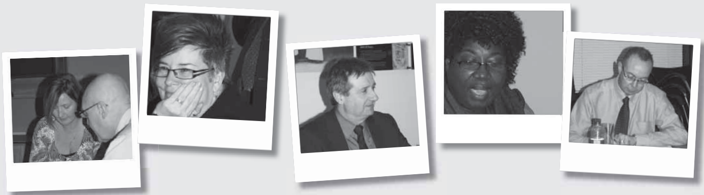
Members of our accessibility and transparency discussion group at their recent meeting.

interests of minority-ethnic managed/owned businesses across the West Midlands.